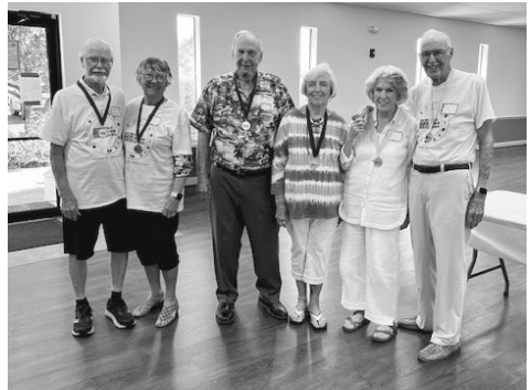
BRIDGE Sanlan Golf & RV Resort, Lakeland