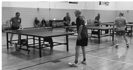
TABLE TENNIS Haines City Community Center