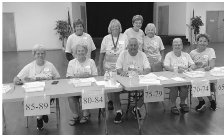
PEPPER Sanlan Golf & RV Resort