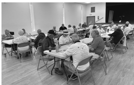
CRIBBAGE Simpson Park in 2026