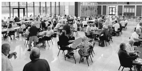
EUCHRE Bartow Civic Center