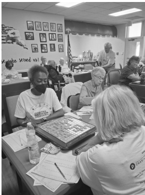
SCRABBLE Lake Morton Senior Living