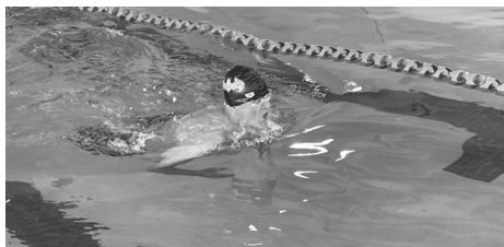
SWIMMING Chain O' Lakes Complex in 2026