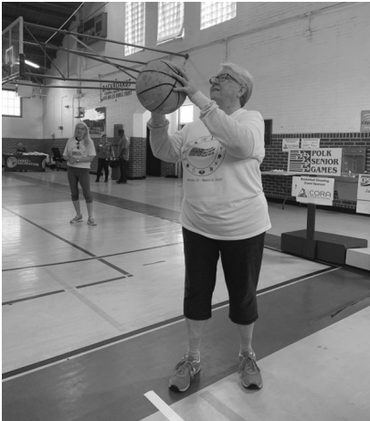
BASKETBALL SHOOTING Kirkland Gym, Lake Wales