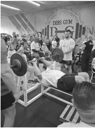
POWERLIFTING Debs Gym, Lakeland