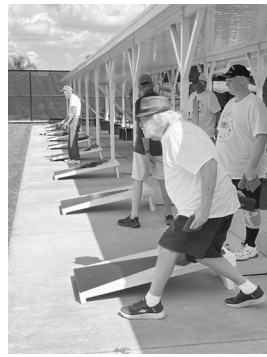
BAG TOSS Lake Region Village, Haines City