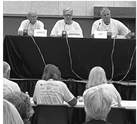
SENIOR SMARTS First Baptist Church Bartow