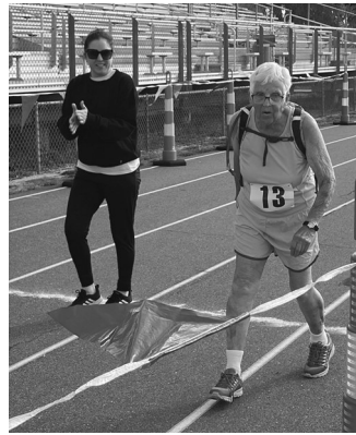
ROAD RACE 5K Bartow High School