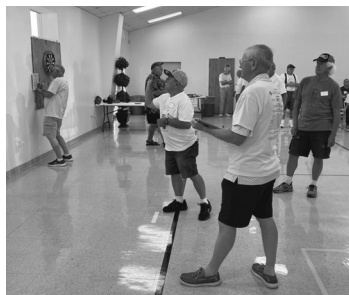
DARTS Medulla Baptist Church