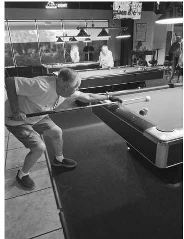
BILLIARDS Brewlands Bar and Billiards North