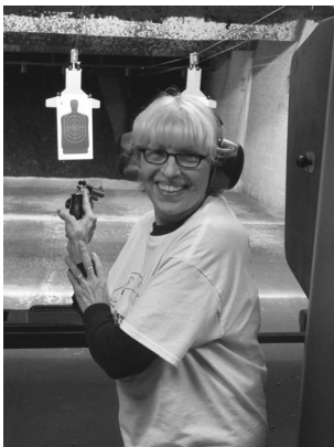
PISTOL SHOOTING Shoot Straight Lakeland