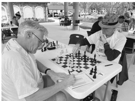
CHESS The Estates at Carpenters