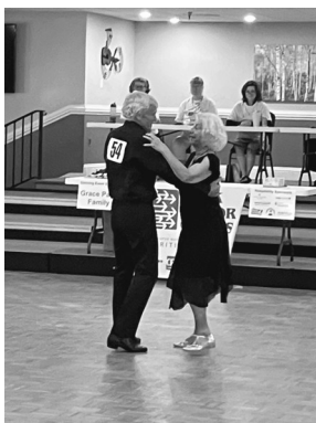
DANCING The Hamptons, Auburndale