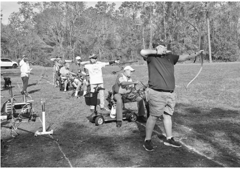
ARCHERY Central Florida Archers