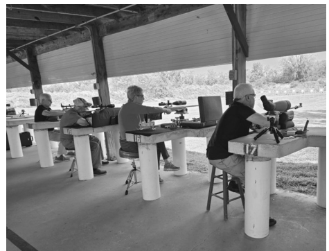
RIFLE SHOOTING Lakeland Rifle & Pistol Club