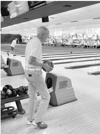
BOWLING Maple Lanes Lakeland